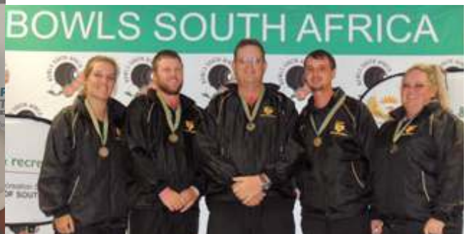
U30 BOLAND ID BRONZE MEDALLISTS