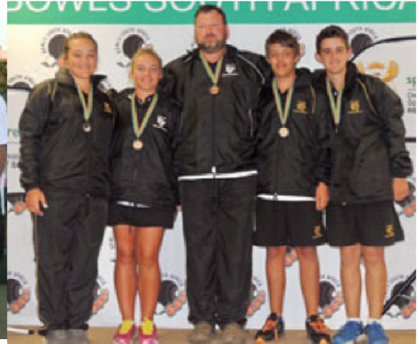
BOLAND U15 BRONZE MEDALLISTS