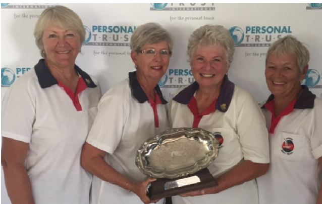
PLATE WINNERS 2017 ALL CAPE