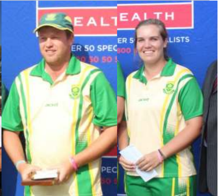
BRONS 2017 SA JUNIOR MEESTERS EN SA OPE MEESTERS