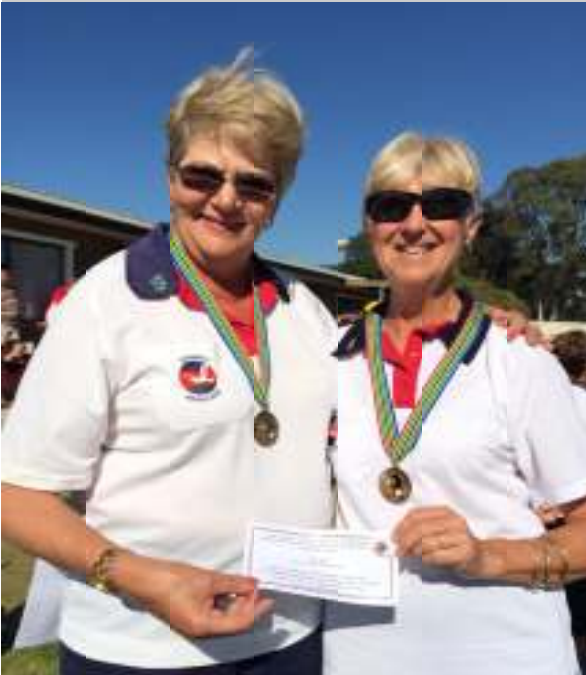
SEMI-FINALISTS SA NATIONAL PAIRS