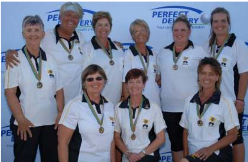
BRONZE LADIES OPEN INTER-DISTRICTS