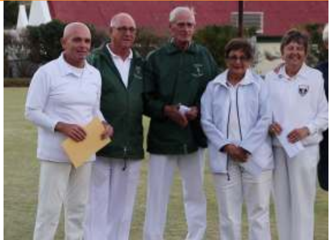
Winning team from Stilbaai Bowling Club : President's Day April 2017