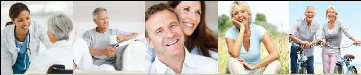
NOORDHOEK MANOR - CLÉ DU CAP - BRIDGEWATER MANOR - HERITAGE MANOR - ONRUS MANOR