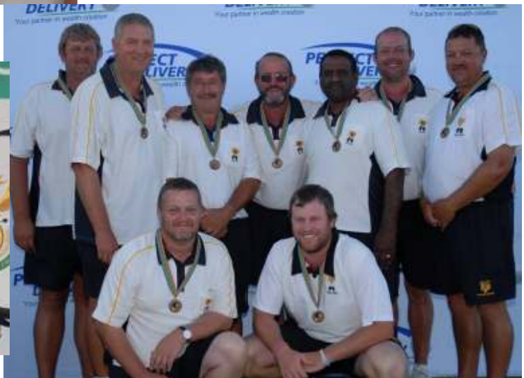
BRONS : OPE MANS 2017 INTERDISTRIKTE